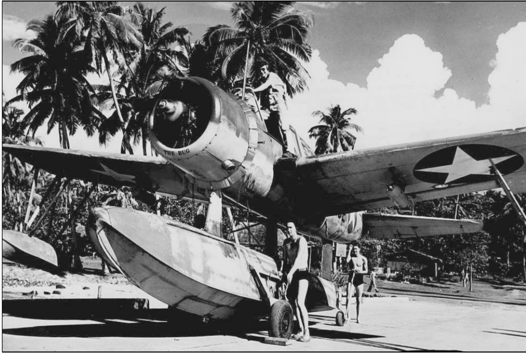
"The Bug," the OS2U Kingfisher seaplane that found Capt. Eddie Rickenbaker and others after their 21-day odyssey adrift in the Pacific Ocean. "The Bug" also survived the attack on Pearl Harbor.